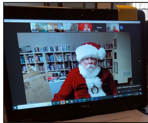
Santa joined the fun during Zoom Christmas Caroling on November 29th