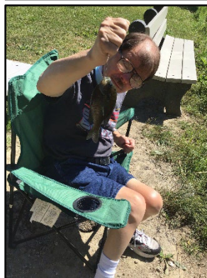
Individuals enjoying time at Day Program doing projects, playing games, and going on outings!