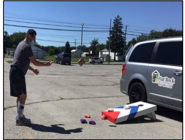
Fun with Corn Hole!