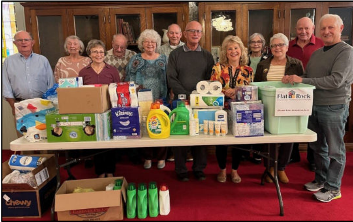
Canal Fulton UMC with an Autumn Supplies Donation. Your church or group may participate in a supply drive, too! Contact engagement@flatrockhomes.org for information.