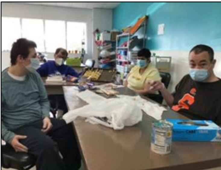
Working on fun projects at Day Program