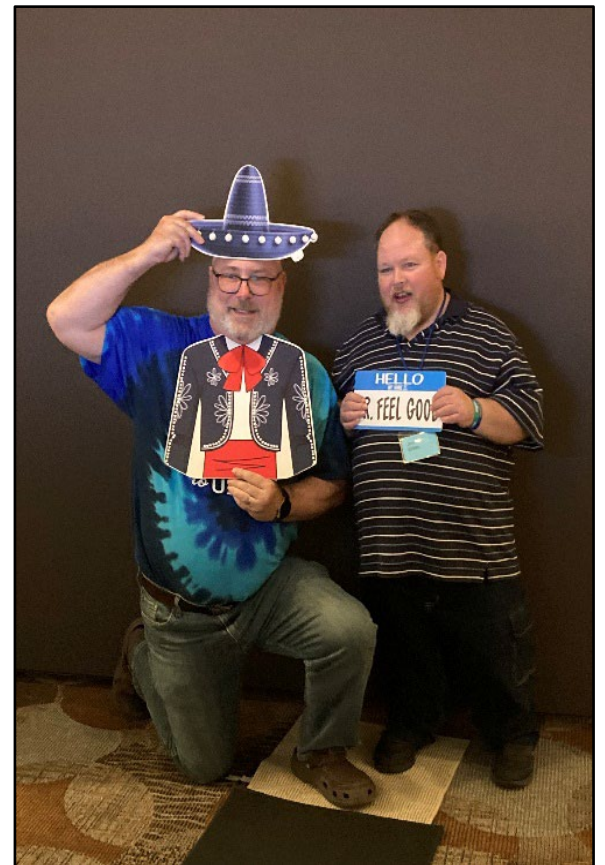
FRCC Resident "J" enjoys the photo booth at Unity Conference